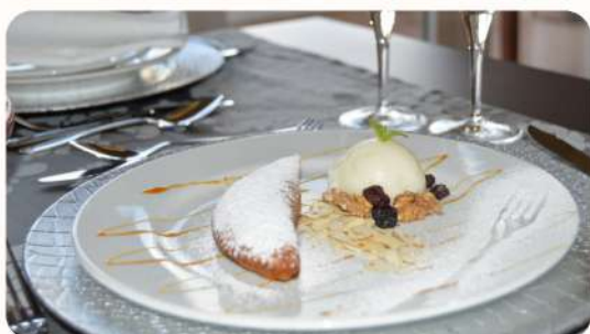
Conventual Sweet of São Bento Traditional Pastry with Sweet Pumpkin and Ice Cream