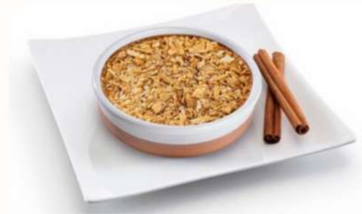
Tarte de Nata