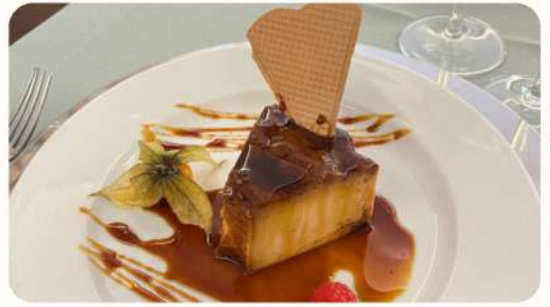
Egg pudding (Homemade)