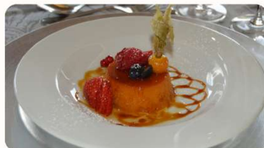
“Abade Priscos” Pudding A typical sweet from the Braga region. Made with eggs, a big portion of sugar, bacon, port wine, lemon zest and cinnamon sticks.