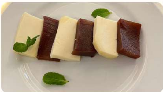
Romeo and Juliet