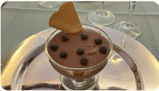
Chocolate mousse (Homemade)