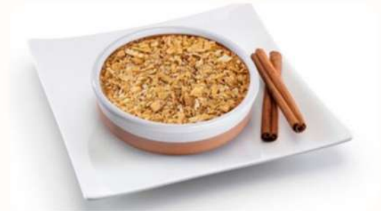
Tarte de Nata