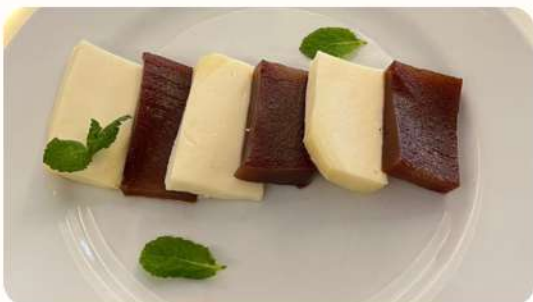
Romeo and Juliet