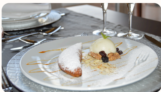
Conventual Sweet of São Bento Traditional Pastry with Sweet Pumpkin and Ice Cream