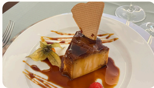
Egg pudding (Homemade)