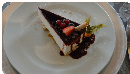
Red Fruits Cheesecake