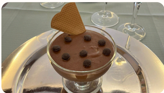
Chocolate mousse (Homemade)