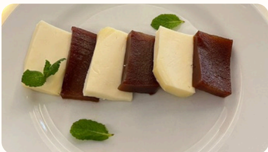
Romeo and Juliet