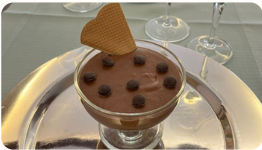
Chocolate mousse (Homemade)