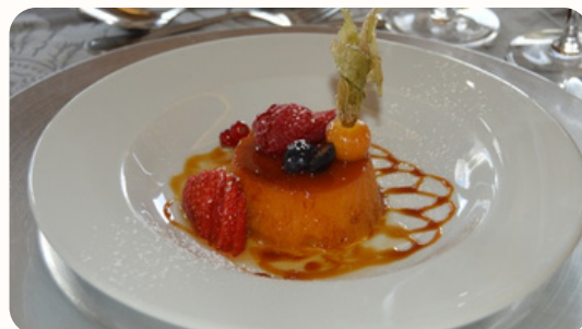
“Abade Priscos” Pudding A typical sweet from the Braga region. Made with eggs, a big portion of sugar, bacon, port wine, lemon zest and cinnamon sticks.