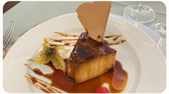
Egg pudding (Homemade)